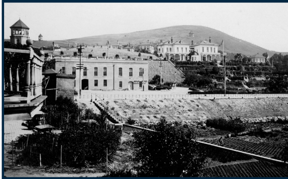
San Quentin State Prison - 1852 CDCR's First Prison

When the prison system in California was founded, it was predominantly grounded in the Custodial Model of Corrections which emphasized confinement, control, and punishment over rehabilitation.