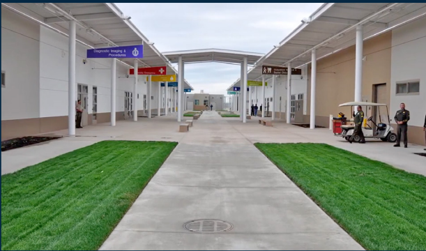
California Health Care Facility - 2013 CDCR's Newest Prison

In March 2026, CDCR completed construction on the San Quentin Learning Center , a huge step in supporting rehabilitation and reentry efforts.